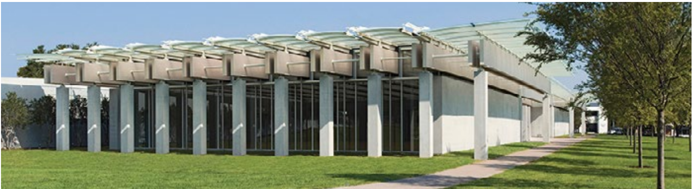
Above: © Piano Pavillion , Renzo Piano, Kimbell Art Museum

A new building, designed by the renowned Italian architect Renzo Piano, opened November 27, 2013.