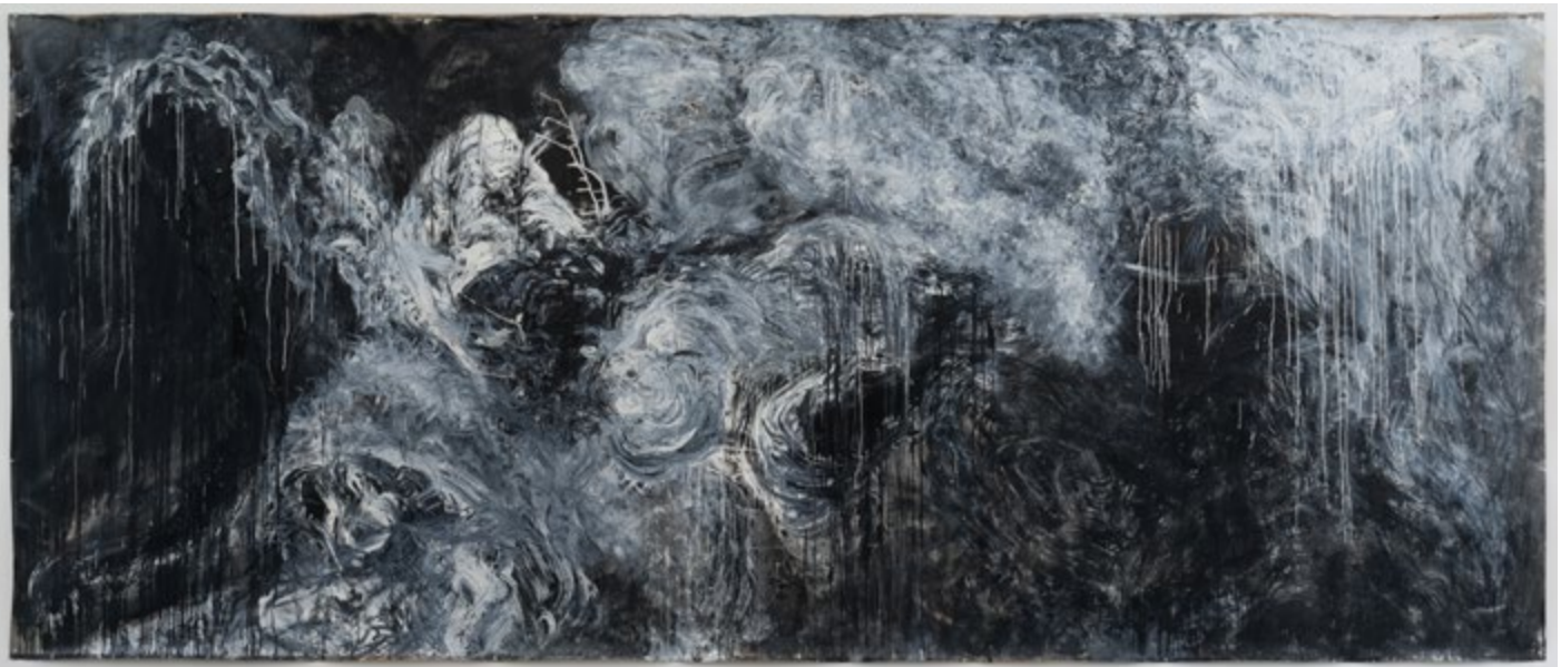
Above: © Untitled , Shen Wei, Oil and acrylic on canvas, 79 x 216 inches, 2013

Shen Wei's artistry and imagery are stunning, sophisticated and ethereal. Internationally recognized for the breadth and scope of his artistic vision, Shen Wei is a prolific choreographer, stage director, set/costume/lighting/make-up designer, painter and filmmaker. A MacArthur "Genius" Award recipient, he gained worldwide acclaim as the lead choreographer for the Opening Ceremonies of the 2008 Summer Olympics in Beijing. The New York Times proclaimed, "If there is something to write home about in the dance world, it is the startlingly imaginative work of the Chinese-born choreographer Shen Wei." This amazing performance is in collaboration with an exhibition and salon discussion hosted by the Crow Collection of Asian Art.